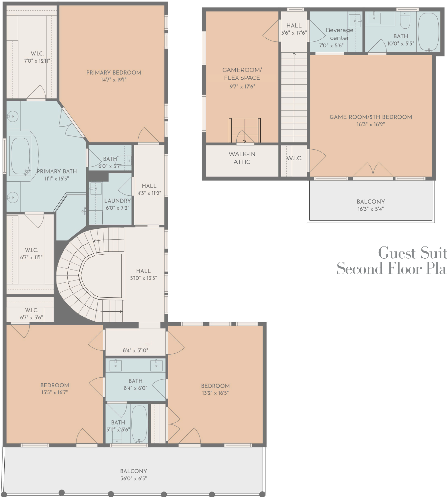
Guest Suite Second Floor Plan